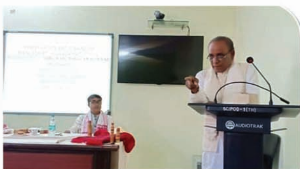
Talk on Preservation and making of Manuscript in Sanchipat