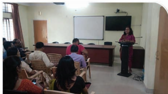
Visit of RUSA official from MHRD, New Delhi