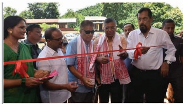
Inauguration of new College Library