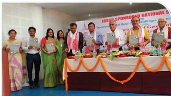
Release of Sonapur College News Bulletin 2018