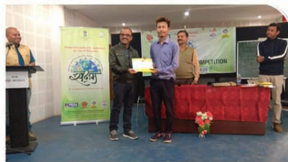
Energy Conservation Workshop-Saksham at the College