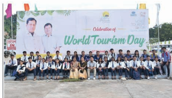
Dept. of TTM in World Tourism Day at Kalakshetra