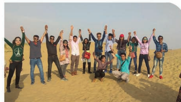
Students' Excursion to Rajasthan