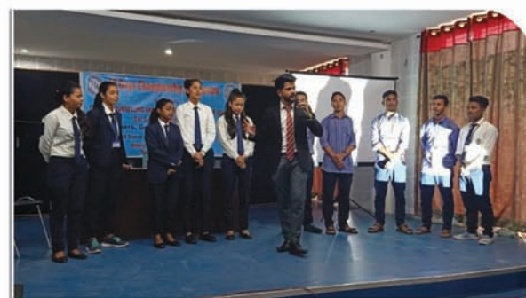
02 Days Championship Programme