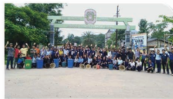
Cleanliness drive by NSS unit & students