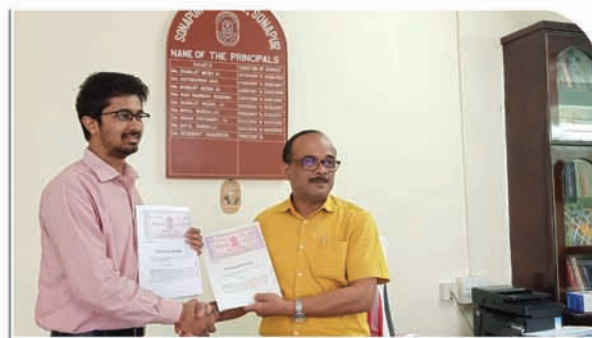
MoU signing with CSAP for PRAJNAN