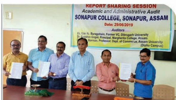
Report sharing of Academic & Administrative Audit