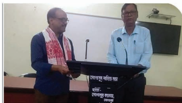
Donation of podium to Sonapur Sahitya Sabha