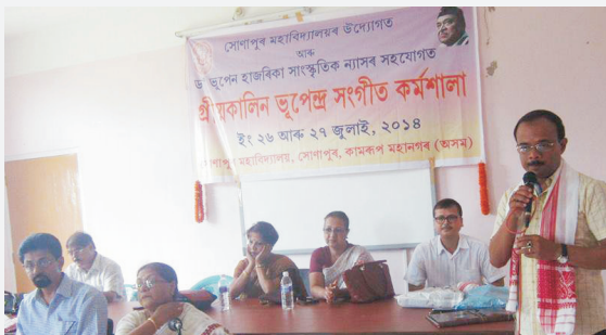
Summer Workshop on Bhupendra Sangeet