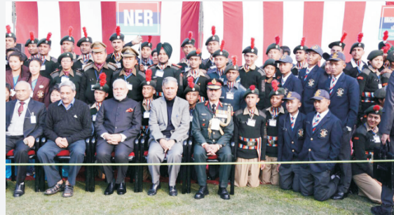
Our NCC Cadets with PM Modi during Republic Day celebration in New Delhi