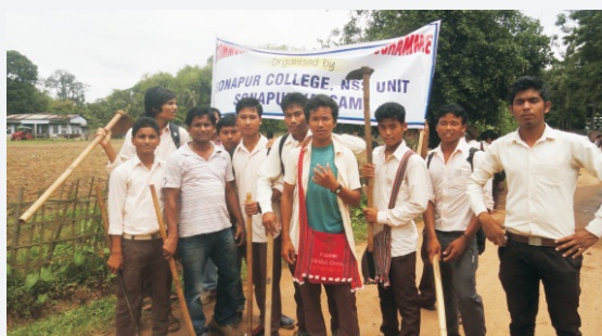
Road repairing programme by Sonapur College NSS unit