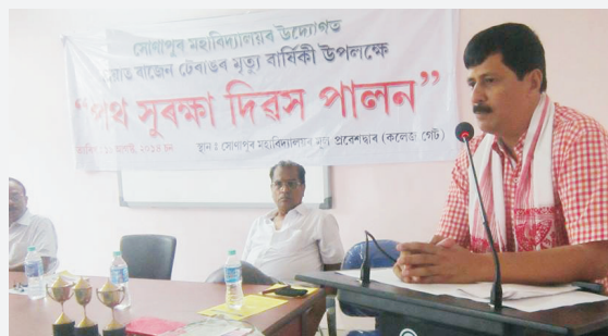
Road Safety Day observed in the College