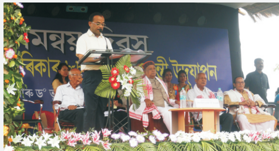
Celebration of 88th birth anniversary of Dr. Bhupen Hazarika