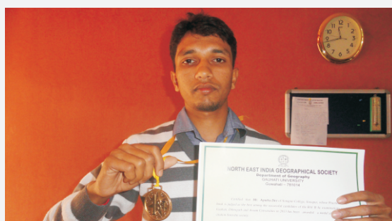
Achiever of best practical note book award by NEIGS