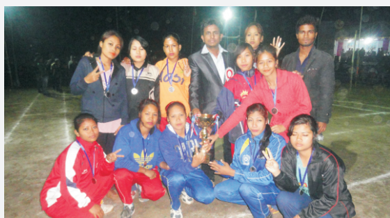
Runners Up Team of Inter College Kabadi Competition under GU