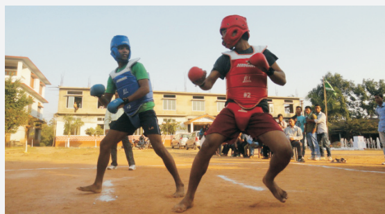
Participants of Annual College Week Celebration