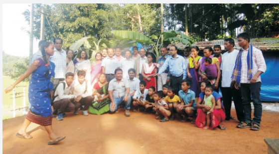
NAAC Peer Team visit to Dikchak Village