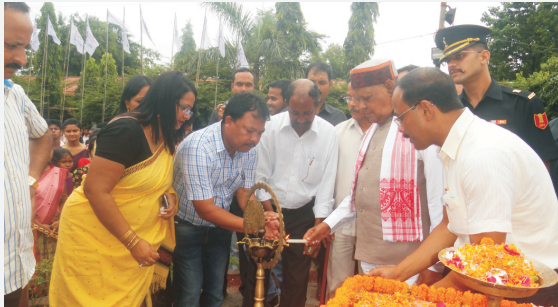
Celebration of 88th birth anniversary of Dr. Bhupen Hazarika