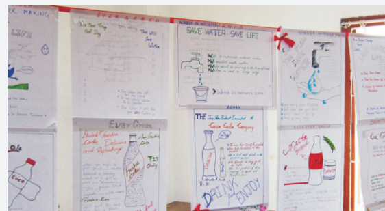
Workshop on Advanced Writing Skill