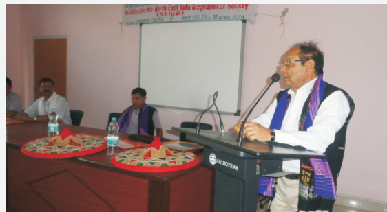
State Level Workshop GIS, GPS & RS