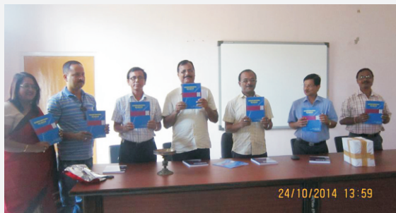
Release of Sona Sophia