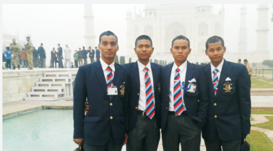
Our NCC Cadets during Republic Day visit to New Delhi