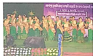
Students' performance in Silver Jubilee