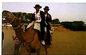
NCC cadets during AIVSC, Jodhpur, Rajasthan