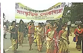
College Week procession