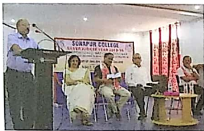
UGC Sponsored National Seminar of English Dept.