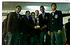
NCC Cadets receiving awards