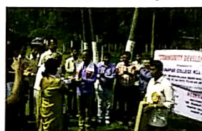
NSS Programme at Mitoni Village