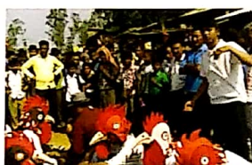
Street play by the students of Theatre and Stagecraft