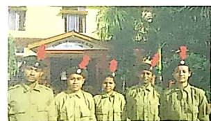
Wings of Fearlessness... NCC Army begins in Sonapur College