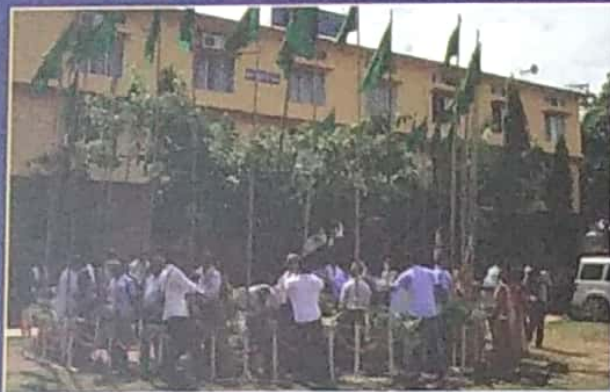
Flag Hoisting by the Founders