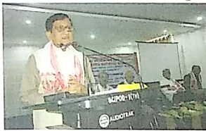
UGC Sponsored National Seminar of Economics Dept.