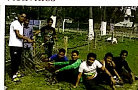
NSS activities at Mitoni Village