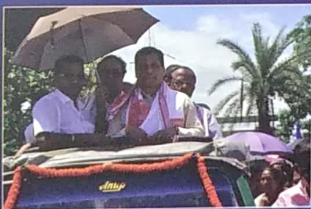
Sjt. Sarbananda Sonowal, Ex. Minister of Sports and Youth Welfare, GOI, and Present CM, being escorted to the college