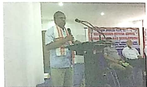
UGC Sponsored National Seminar of Geography Dept.