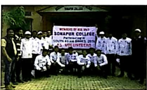
NSS Cadets participated as volunteers in the South Asian Games