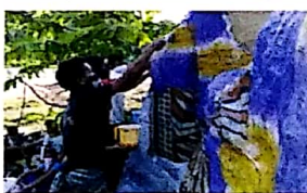
Students participating in Stagecraft activity