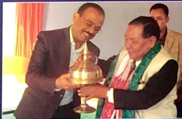
Sjt. P.A. Sangma, Former speaker of Lok Sabha, being felicitated by the Principal on the occasion of North-East Inter College Debating Competition

Sonapur College, Sonapur, Kamrup (Metro), Assam PIN : 782402