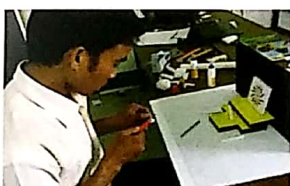
Student participating in Stagecraft activity