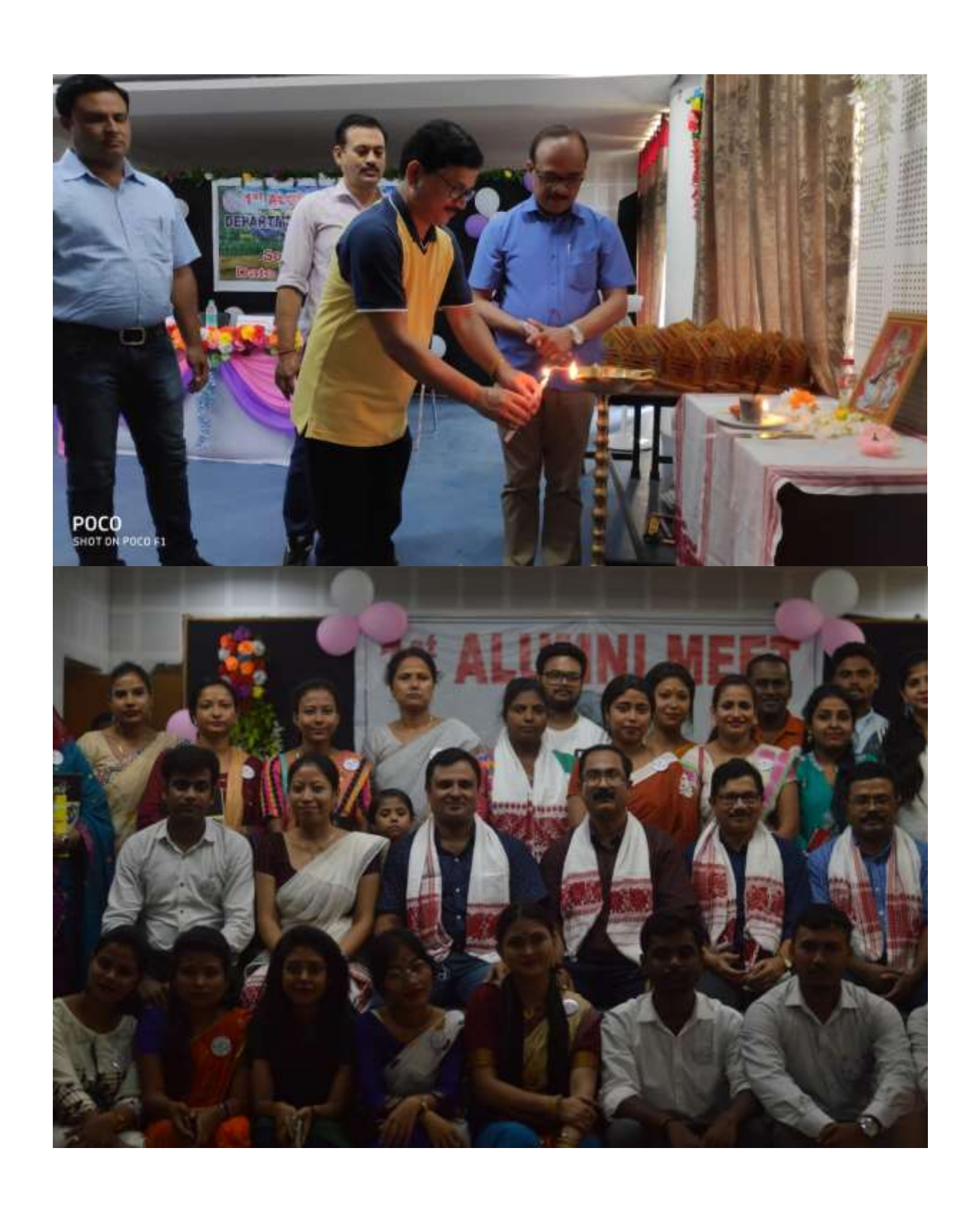
Sd/- Principal, Sonapur College, Sonapur