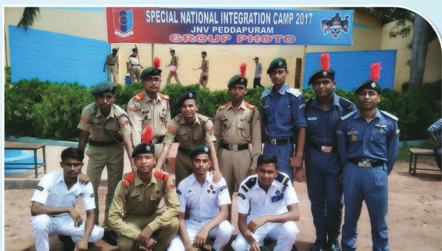
NCC Cadres of Sonapur College