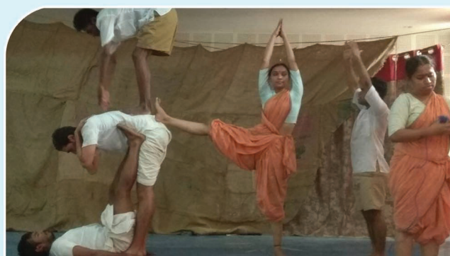
Drama Extension Programme at Sonapur College by Drame Baaz