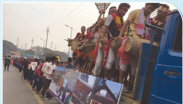
Students participating in Brahmaputra Literary Festival 2017