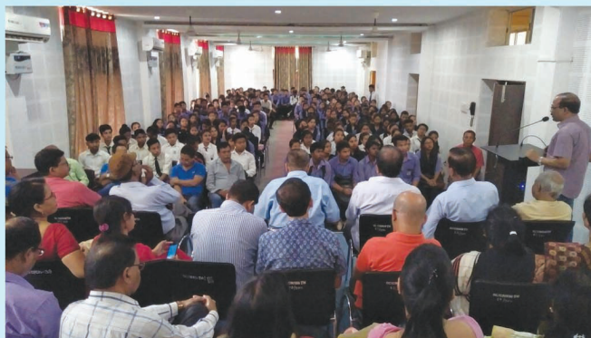
Public meeting as part of NIRF Ranking to Sonapur College

The methodology draws from the overall recommendations and broad understanding arrived at by a Core Committee set up by MHRD. The parameters used under the framework to judge an institution has laid equal stress on the multifaceted responsibilities of an institution. The parameters broadly cover "Teaching, Learning and Resources," "Research and Professional Practices," "Graduation Outcomes," "Outreach and Inclusivity," and "Perception". Thus the NIRF incorporates