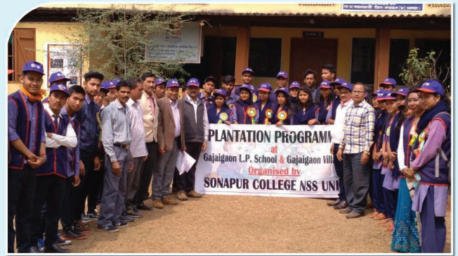
Plantation Programme by NSS Unit, Sonapur College