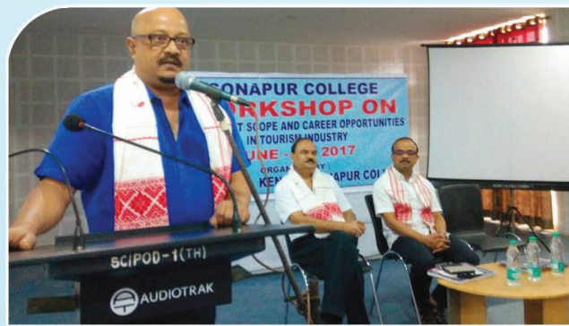
Workshop organised by KAUSHAL KENDRA, Sonapur College