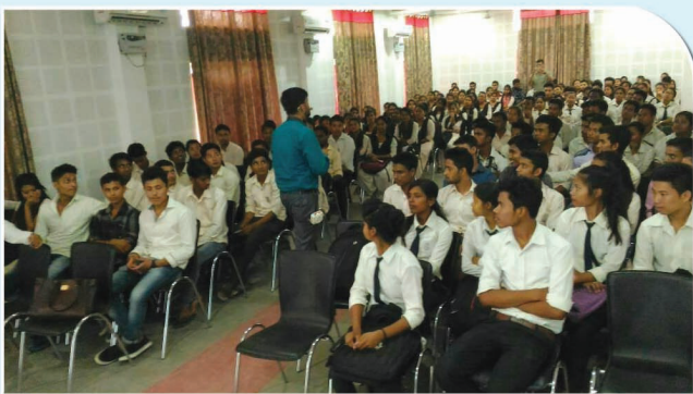
Counselling Programme by ICA