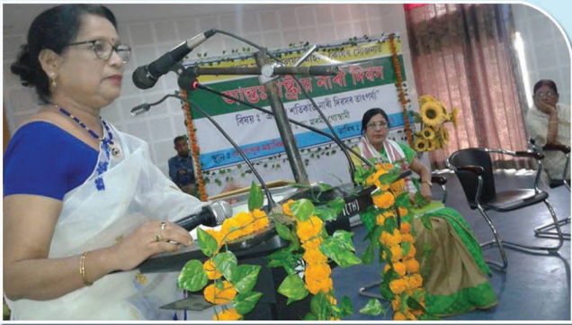
Celebration of International Womens Day