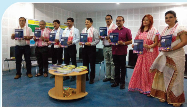
Release of News Bulletin at the Principals' meet