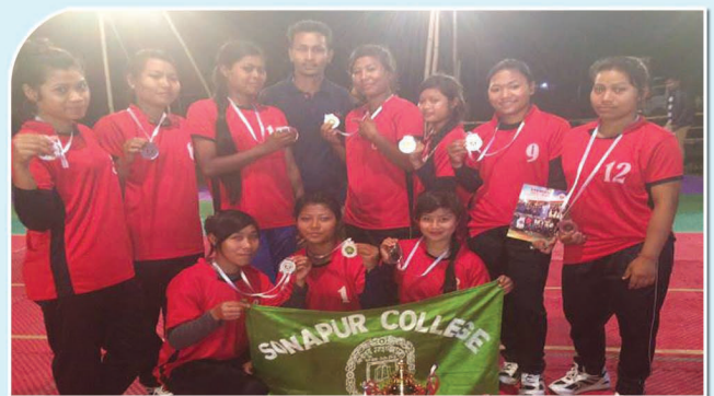
Girls Kabadi team with 1st Runners Up Trophy at G.U Youth Festival