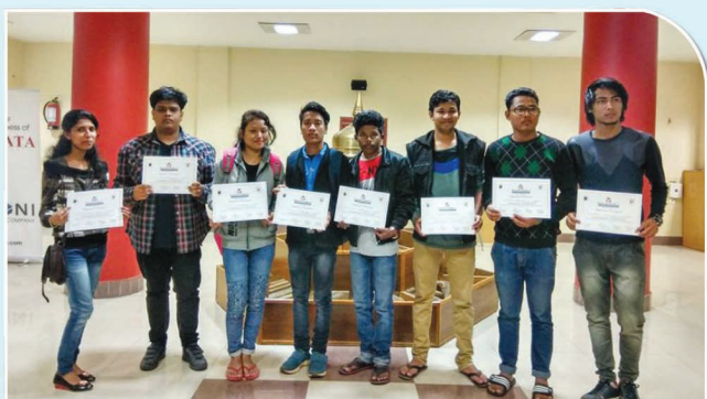
Student participation at Research Conclave organised by IIT, Guwahati