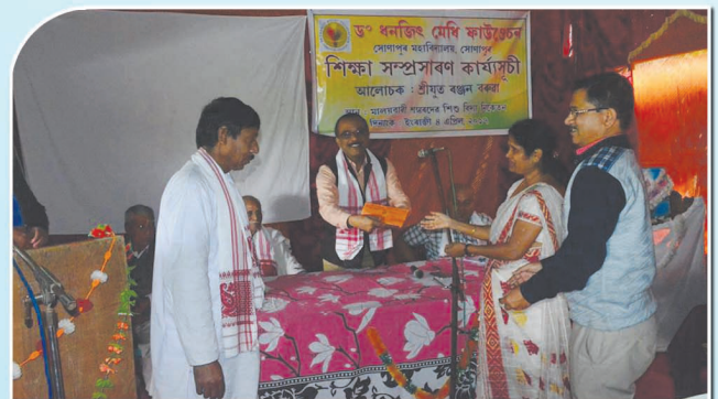
Educational Extension programme by Dr. Dhanjit Medhi Foundation