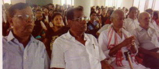
Guests of Foundation Day celebration