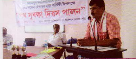
Road Safety Day