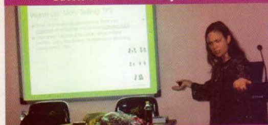
RELO Workshops in the College