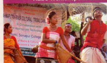
A scene from Seminar cum Cultural Workshop