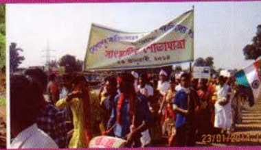
College Week Celebration