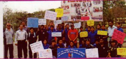
Our NCC Cadets