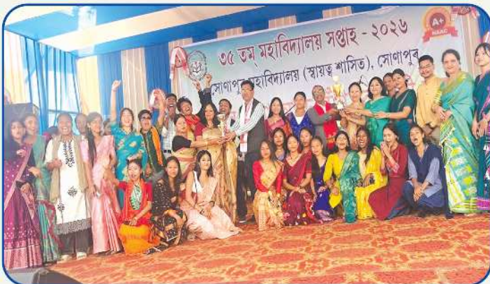
35th College Week