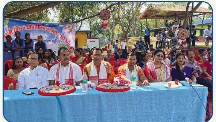
Rongali Bihu Celebration in the College Campus