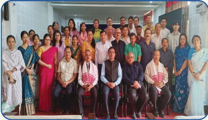
Meeting with new Governing Body