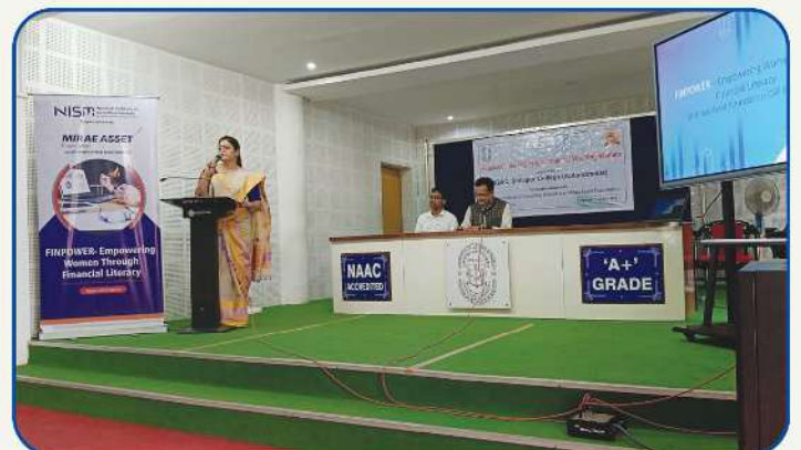
Financial Literacy Programme for Working Women