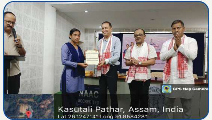
Distribution of forms of Nijut Maina Scheme