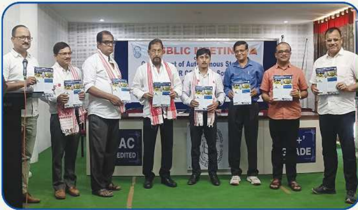
Public Meeting on Conferment of Autonomous Status