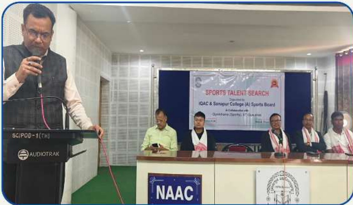
Sports Talent Search in the College