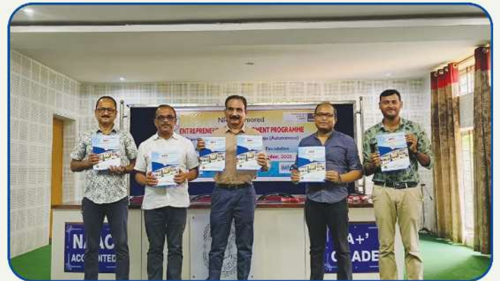
Release of IGNITE - bulletin of IIC of the College