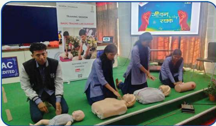
Training session on Basic Trauma Life Support