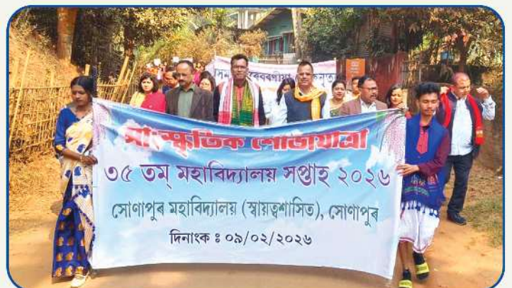
Cultural Procession on the occasion of College Week