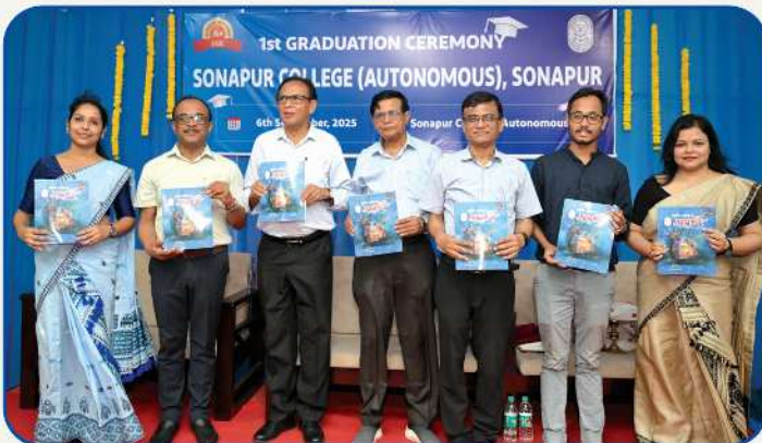
Release of Annual College Magazine