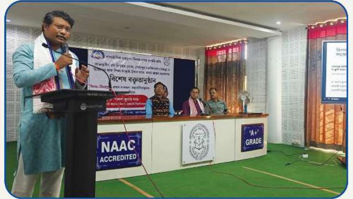
Talk on the occasion of International Mother Language Day