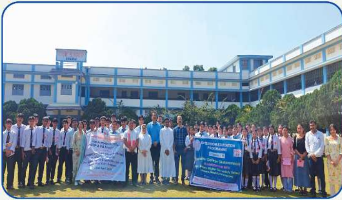
Extension Education Programme in West Karbi Anglong