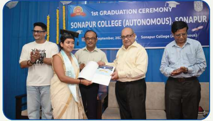
1st Graduation Ceremony