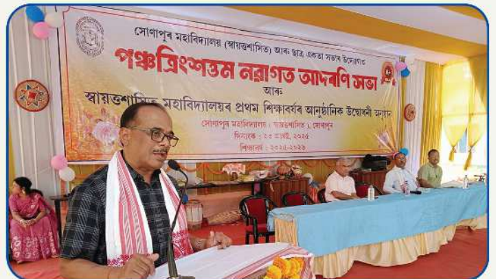
35th Freshers Social Function