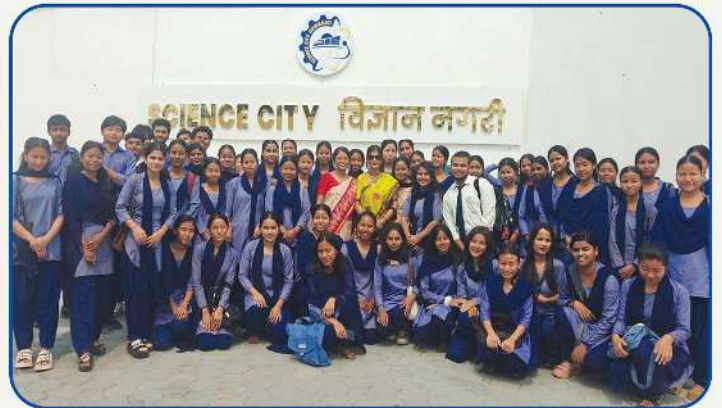
Students Attending the Inauguration of Science City