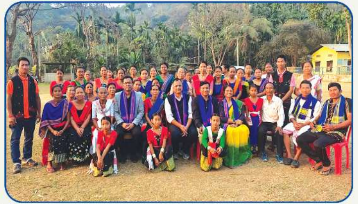
Interaction with residents of DIKCHAK, the adopted village