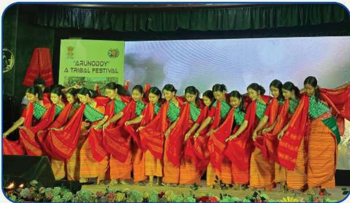
Students Participating in Arunodoy - A tribal Festival