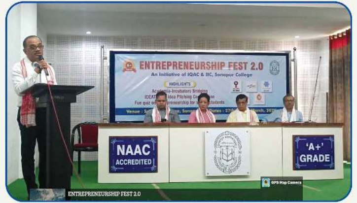
Entrepreneurship Fest 2.0