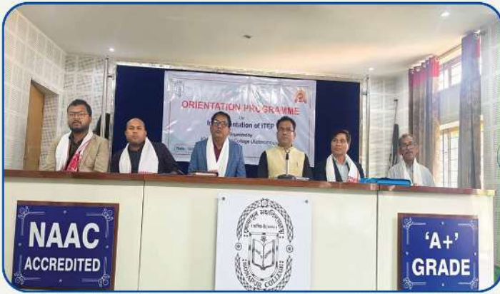
Orientation Programme on Implementation of ITEP