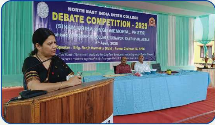
NE India Inter College Debate Competition-2025