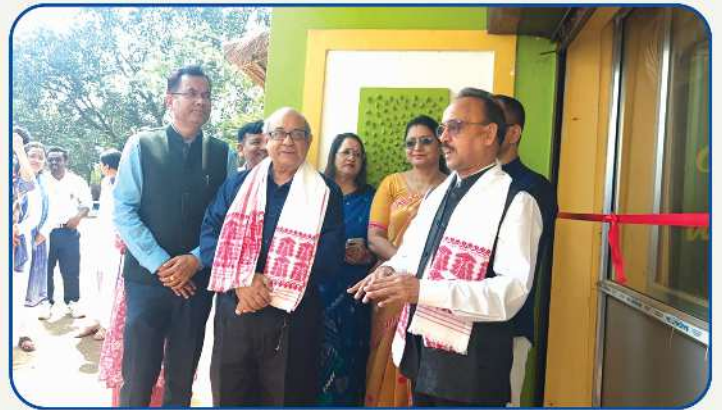
Inauguration of different wings of Sona Harvest